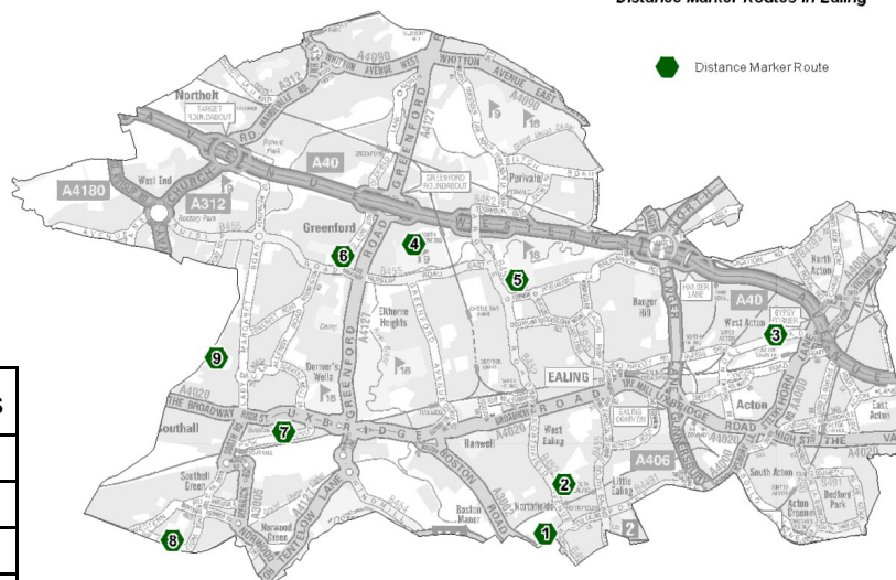
Distance Marker Routes in Ealing

© Crown copyright and database right 2012 Ordnance Survey LA0100019007