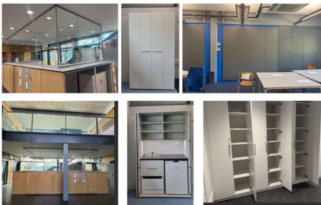
AFTER Photos- showing enclosed office area to the atrium space, new kitchenette & new storage provision

Creation of enclosed break out workspace to atrium with glass partition, alterations to storeroom, addition of a hoist to a changing room and provision of new kitchenette and improved storage to the first-floor music/meeting room for flexibility.