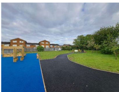
Provision of a New play equipment