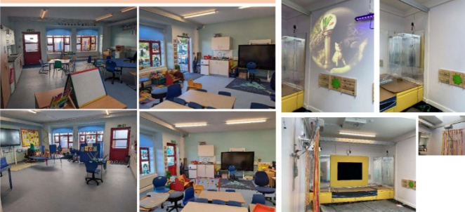
Provision of Indoor Special Needs equipment