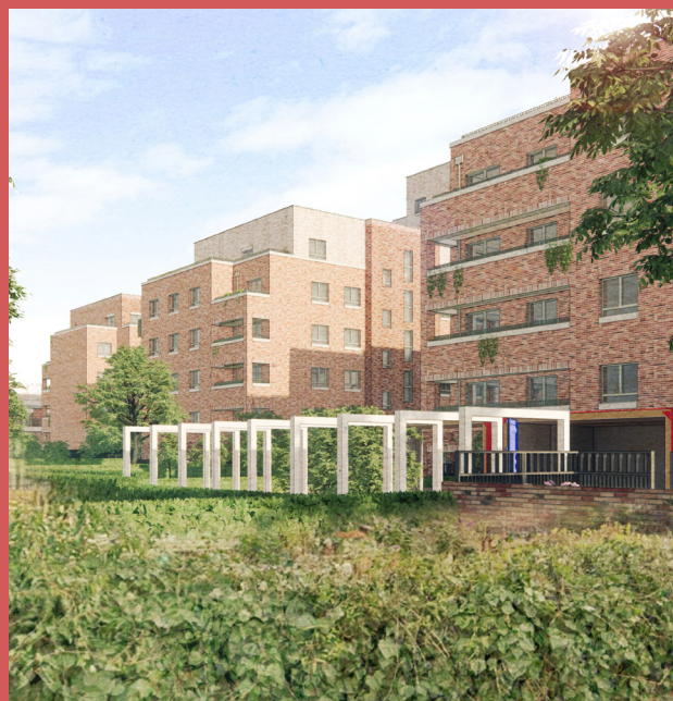
A computer generated image of the new development at South Acton

Once completed, it will host almost 3,500 new homes, with approximately 40% to be let to people on the council's housing waiting list.