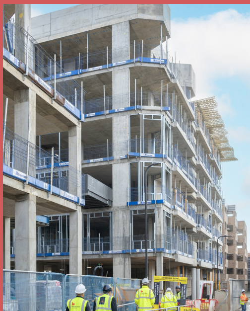
The core of the new building at Golf Links is now complete.

This phase of development is expected to be completed in autumn 2026, with the new tenants moving in shortly after. Building work to redevelop the Golf Links estate got underway in March 2013. Two phases of regeneration have already been completed at the estate, with the construction of Dormers Rise in 2016 and Peterhead Court in 2019.