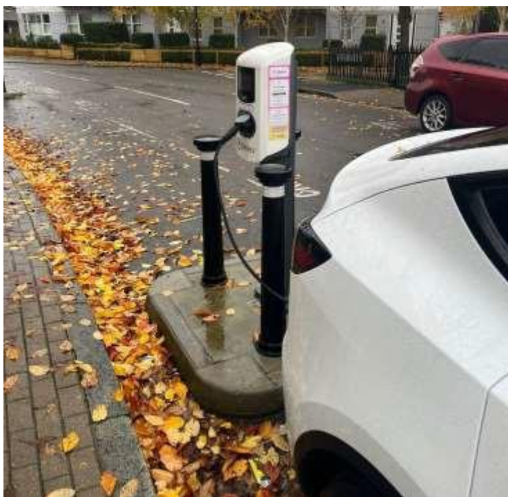
Figure 2 shows an example of a Believ charge point that is located on a build out in the carriageway.

The charger is connected to the electrical distribution grid beneath the pavement. It allows electric vehicles to access the power grid by connecting a charging lead between the vehicle and charge point (post). The charge point requires a small feeder pillar which will be located on the carriageway. This is to ensure that the footpath remains accessible to pedestrians.