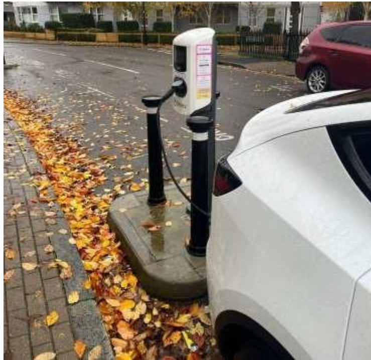
Figure 2 shows an example of a Believ charge point that is located on a build out in the carriageway.

The charger is connected to the electrical distribution grid beneath the pavement. It allows electric vehicles to access the power grid by connecting a charging lead between the vehicle and charge point (post). The charge point requires a small feeder pillar which will be located on the carriageway. This is to ensure that the footpath remains accessible to pedestrians.