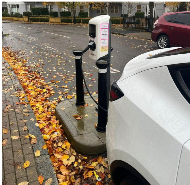
Figure 2 shows an example of a Believ charge point that is located on a build out in the carriageway.

The charger is connected to the electrical distribution grid beneath the pavement. It allows electric vehicles to access the power grid by connecting a charging lead between the vehicle and charge point (post). The charge point requires a small feeder pillar which will be located on the carriageway. This is to ensure that the footpath remains accessible to pedestrians.