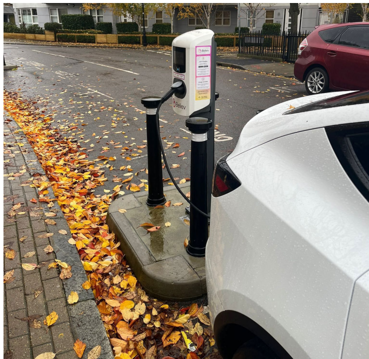
Figure 2 shows an example of a Believ charge point that is located on a build out in the carriageway.

The charger is connected to the electrical distribution grid beneath the pavement. It allows electric vehicles to access the power grid by connecting a charging lead between the vehicle and charge point (post). The charge point requires a small feeder pillar which will be located on the carriageway. This is to ensure that the footpath remains accessible to pedestrians.