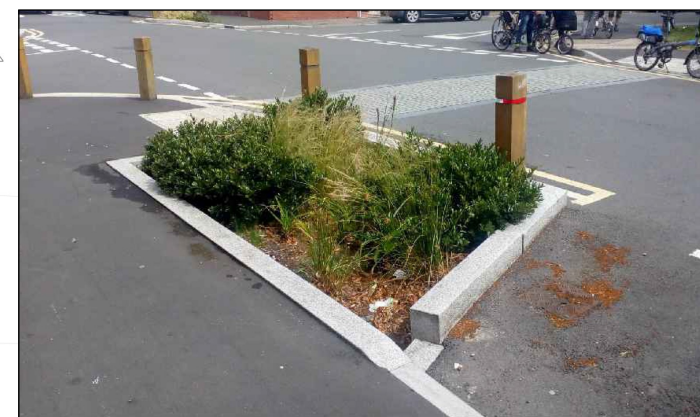
Example of Rain Garden (SUDs) in Cardiff, Wales