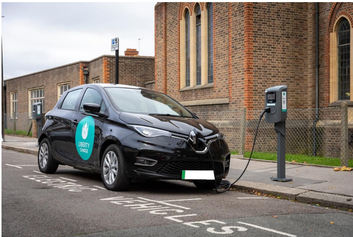
Photo (below): Example of a fast charging point to be installed, allowing residents to charge up to 22 kwh AC.

If you would like further information regarding this consultation, which is not covered within this information letter contact: