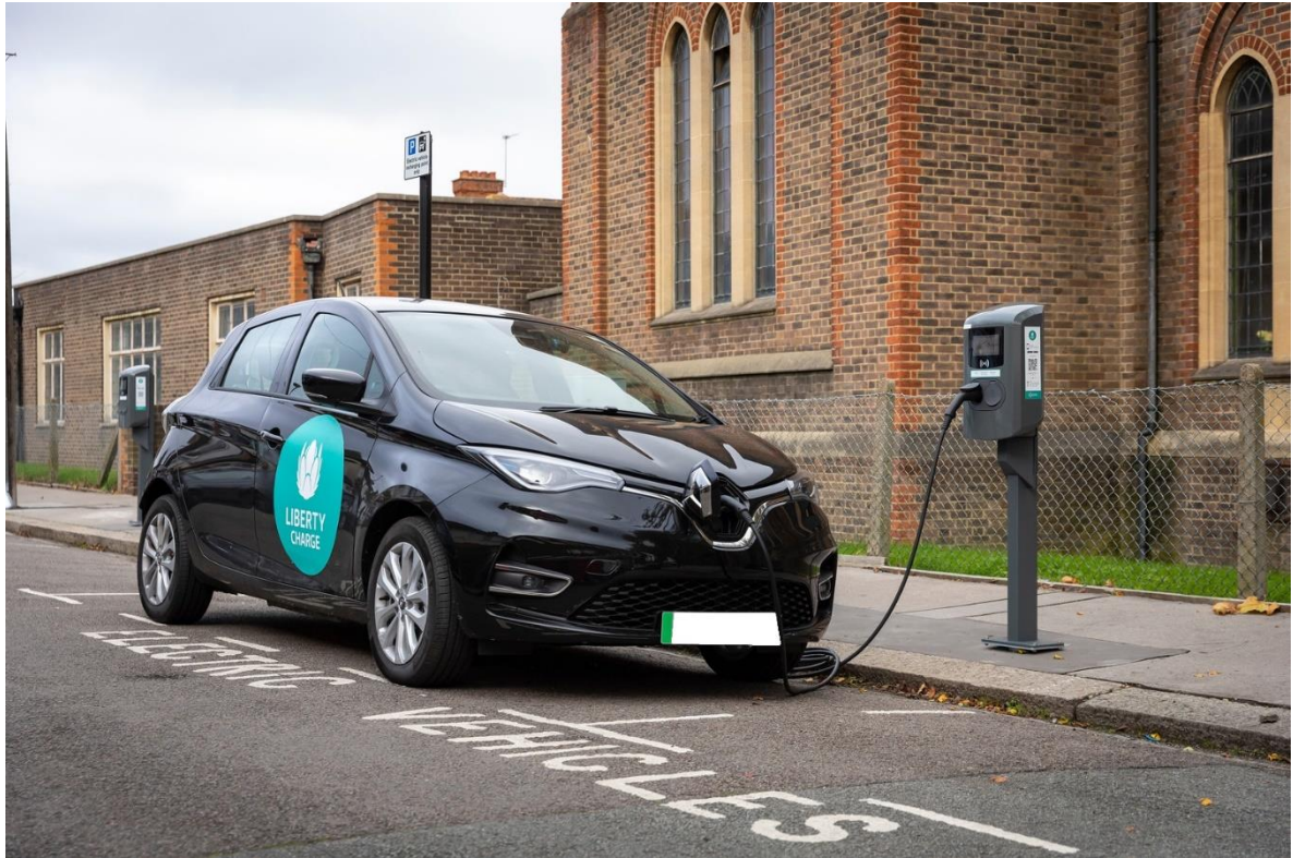
Photo (below): Example of a fast charging point to be installed, allowing residents to charge up to 22 kwh AC.

If you would like further information regarding this consultation, which is not covered within this information letter contact: