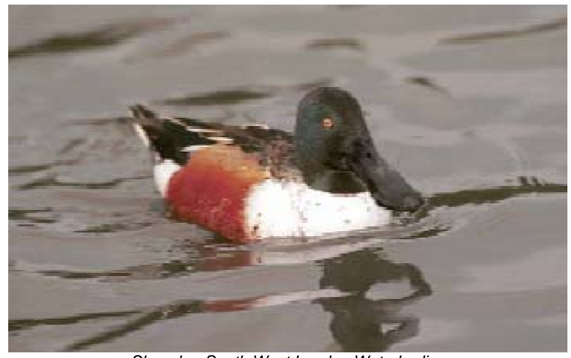
Shoveler, South West London Waterbodies