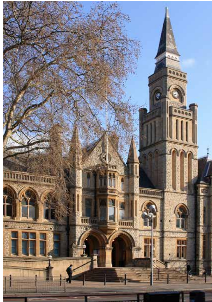
Ealing Town Hall