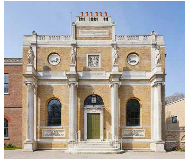
Pitzhanger Manor and Gallery

As a public authority, the London Borough of Ealing is subject to the Freedom of Information Act 2000 (the Act). All requests made to Ealing Council for information with regard to the Design Review Panel will be handled according to the provisions of the Act. Legal advice may be required on a case by case basis to establish whether any exemptions apply under the Act.