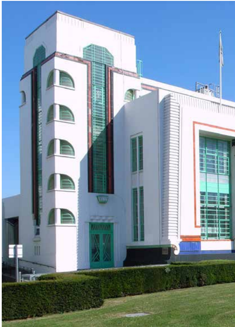
Hoover Building