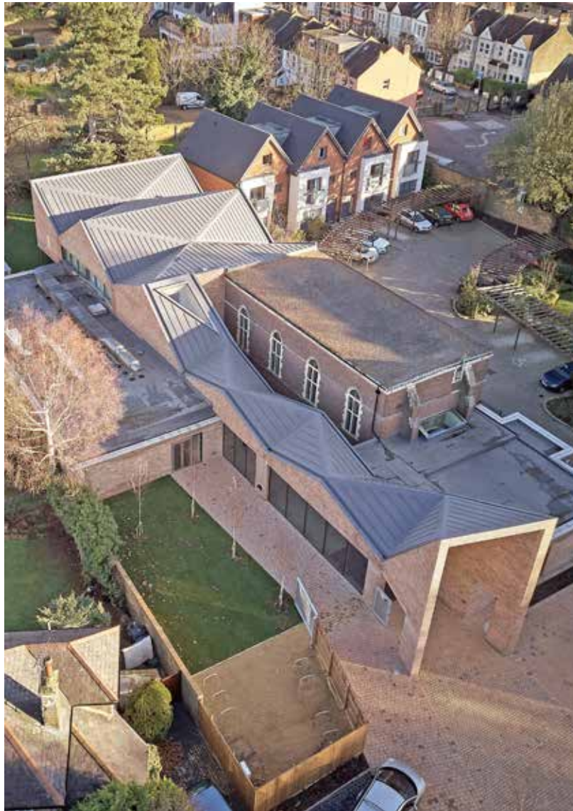
International Presbyterian Church