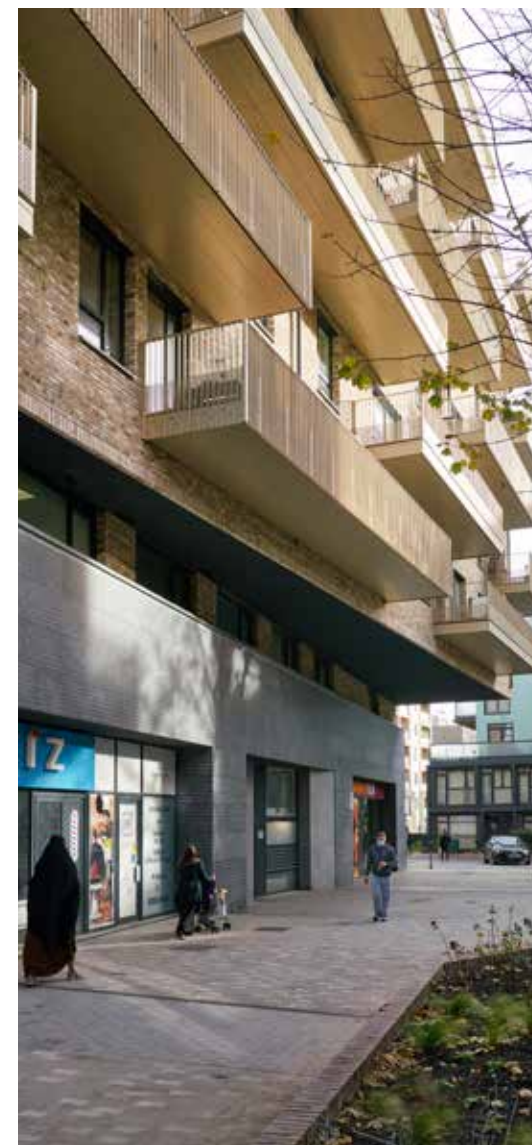
Acton Gardens Estate © Levitt Bernstein

A surgery review will be summarised in a brief document no more than two sides of A4, rather than a full report.