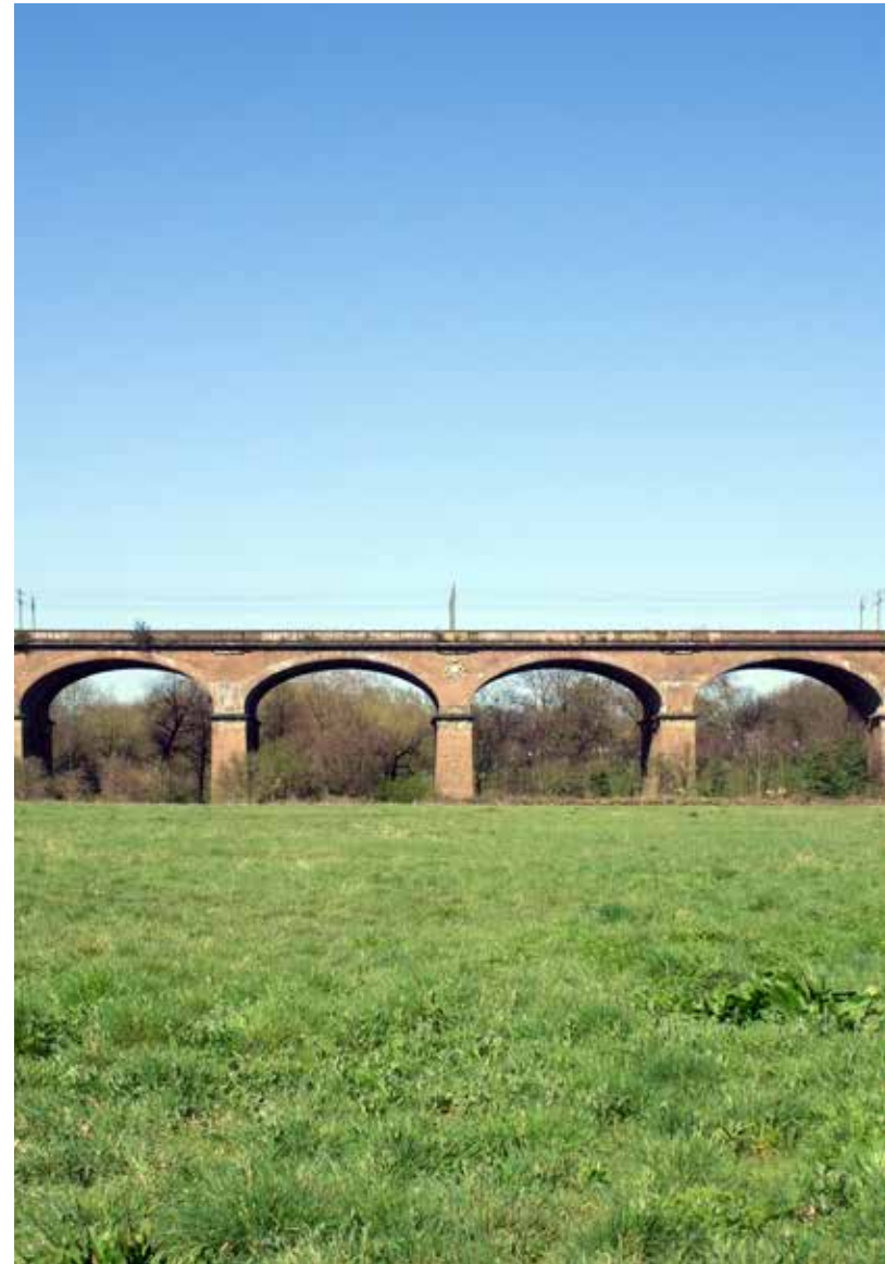
Wharcliffe Viaduct

From time to time, it may be of benefit for specialist advice to be provided beyond the Design Review Panel membership. In such cases, a professional with the relevant expertise may be invited to attend a review meeting, participating in the discussion with the status of an adviser to the panel.