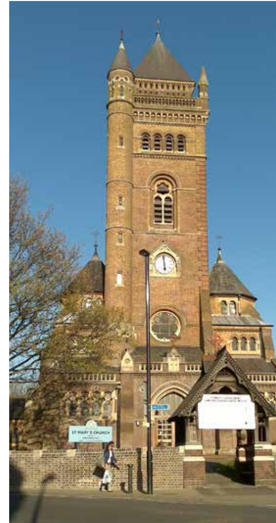
St. Mary's Church

https://www.london.gov.uk/sites/default/files/ggbd_london_quality_review_charter_web.pdf