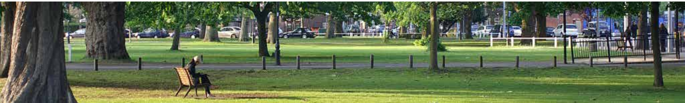
Ealing Green, Walpole Park

Large projects, for example schemes with several development plots, may be split into smaller elements, to ensure that each component receives adequate time for discussion.