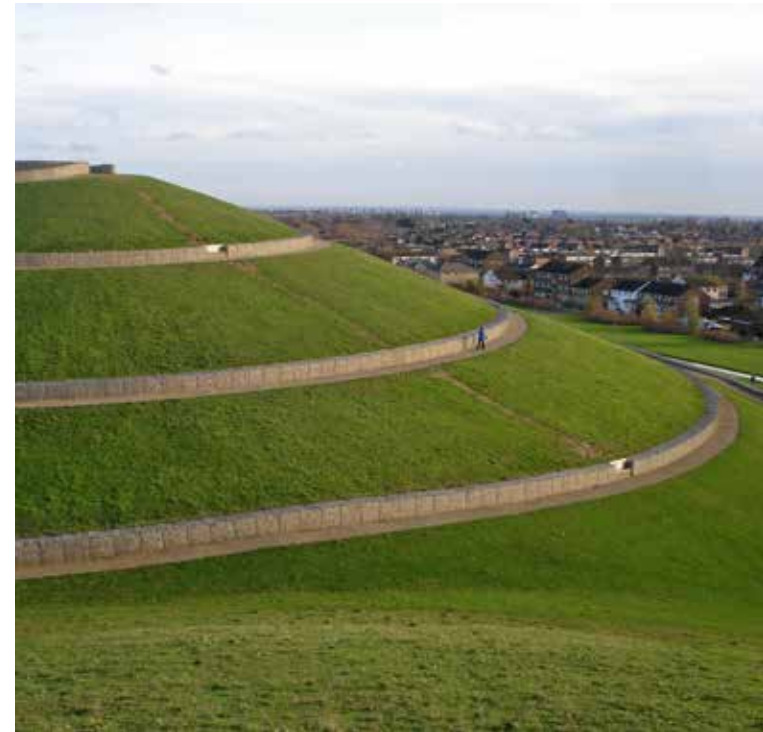
Northala Fields by LDA Design for the London Borough of Ealing

At the end of each year, the Design Review Panel manager will draft an annual report. This will be a brief document describing and reflecting on the panel's activities over the past year. As part of this annual review process, a meeting will be held with key Ealing Council officers and the panel chair to discuss the report and consider any recommendations for the following year.