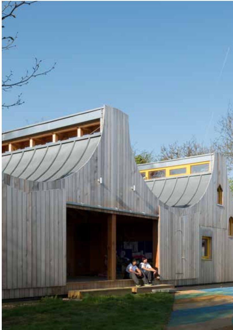
Belvue Woodlands Classroom, Studio Weave