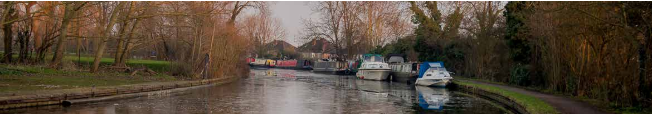
Grand Union Canal

Design Review: Principles and Practice Design Council CABE / Landscape Institute / RTPi / RIBA (2013)