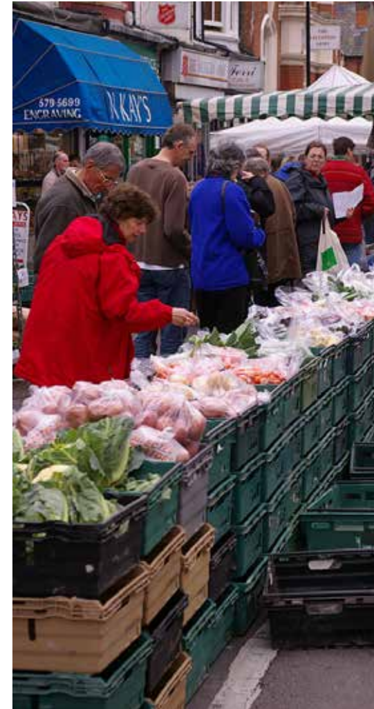
Ealing Farmers market

By offering advice to applicants during the pre-application process and by commenting on planning applications, the Design Review Panel supports Ealing's planning officers and planning committee. The panel will provide a rigorous review process, to ensure exemplary design in all areas of the borough, enhancing Ealing for all those who live, work, and visit.